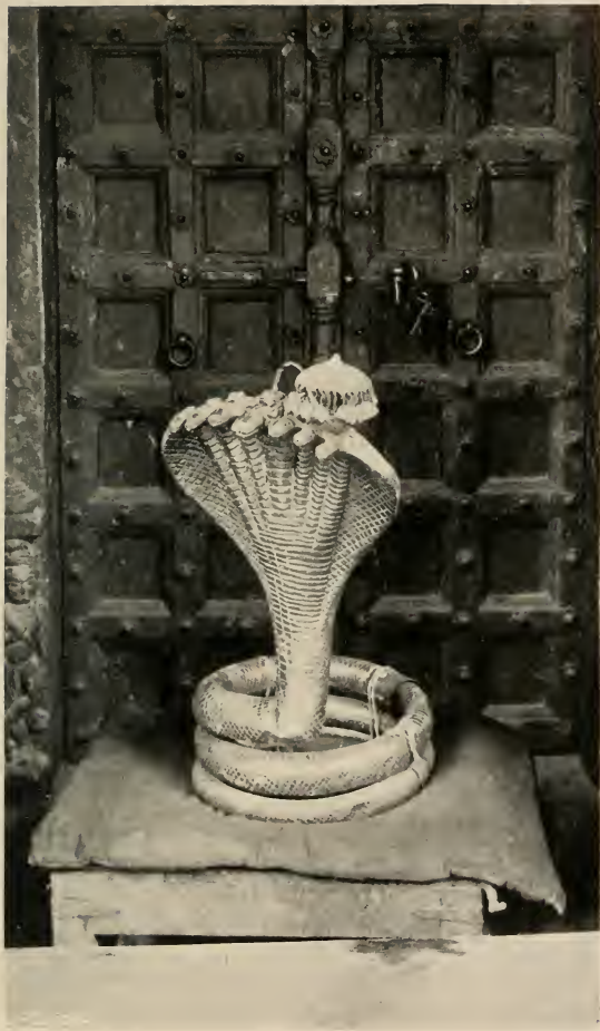
IMAGE OF THE HOUSEHOLD SNAKE.